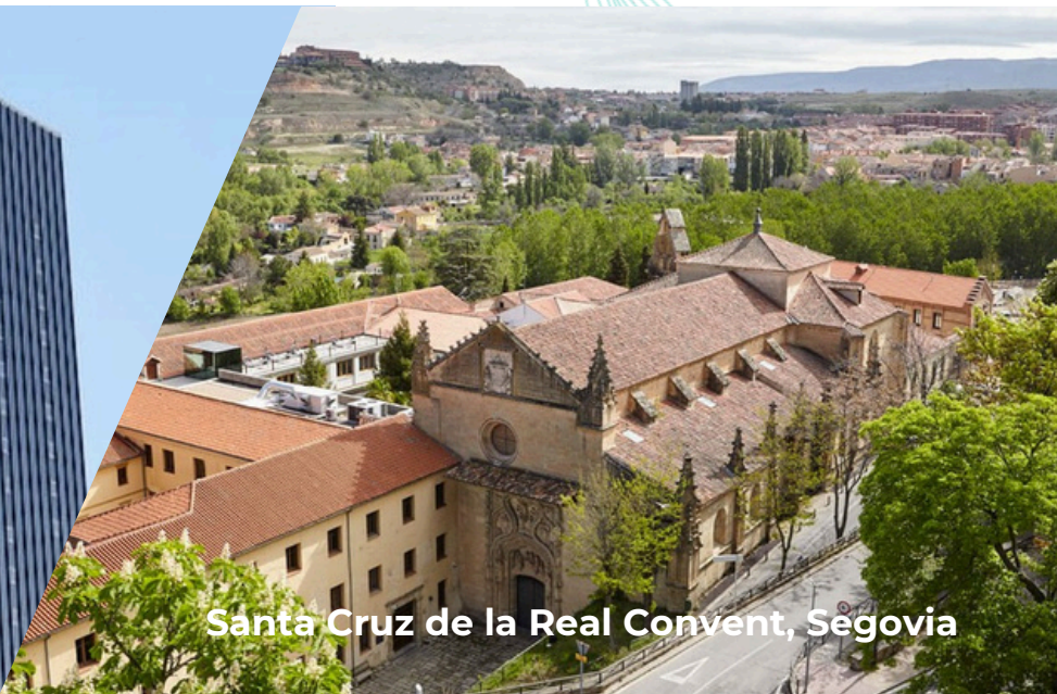
Santa Cruz de la Real Convent, Segovia