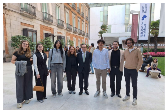
Fellows meet the Internacional Advisory Board of IE University