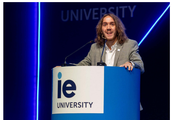
IE University's Onboarding Session