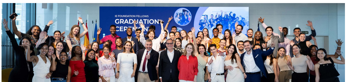
IE Foundation Fellows Graduation Celebration