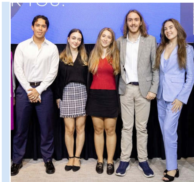
IE Foundation Student Board