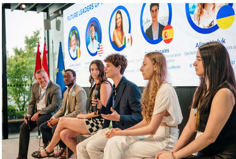
Donor's Cocktail 2024