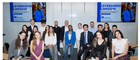
Workshop: Leveraging LinkedIn