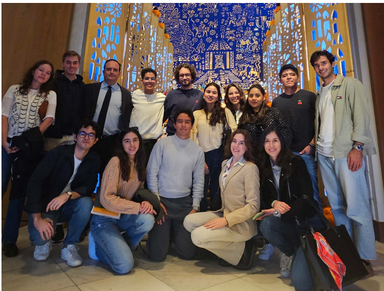
Cultural Event at Fundación Casa de México en España

Our Fellows are committed to becoming leaders of positive impact in more than one way. Besides their academic excellence, as students they actively participate in community initiatives dedicated to fostering a sense of unity and belonging, driving change and promoting the key values of IEU.