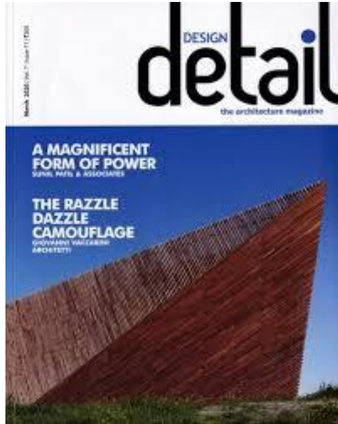
Editor & Writer