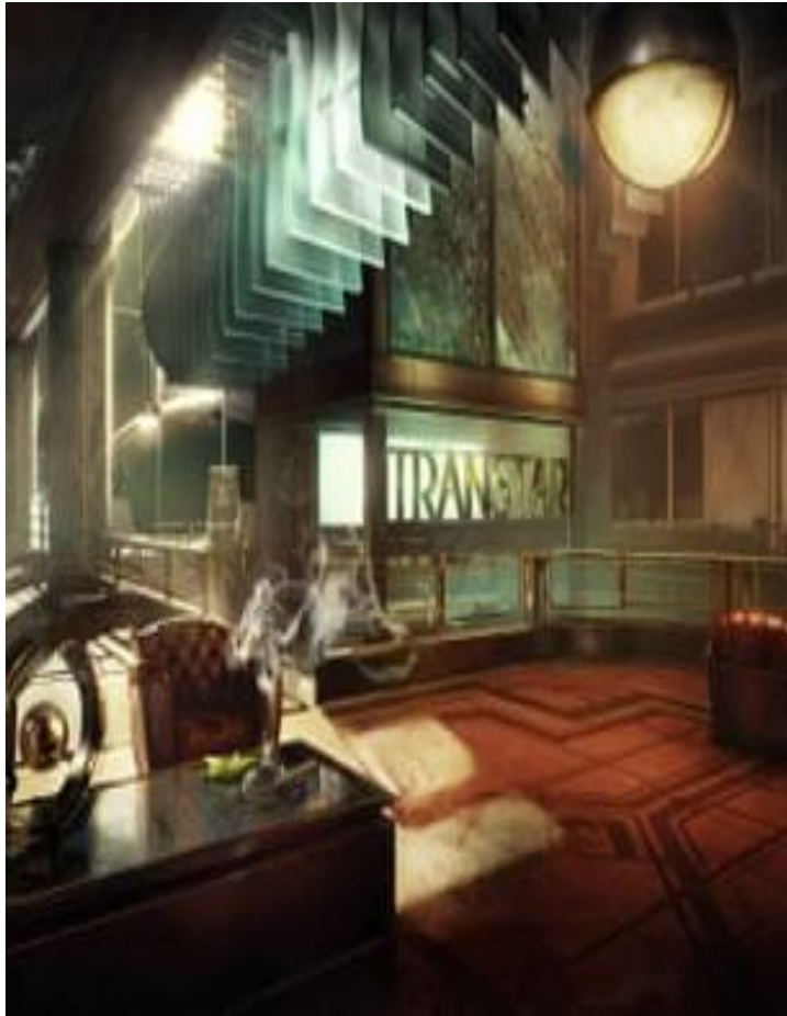
Virtual Reality Designer