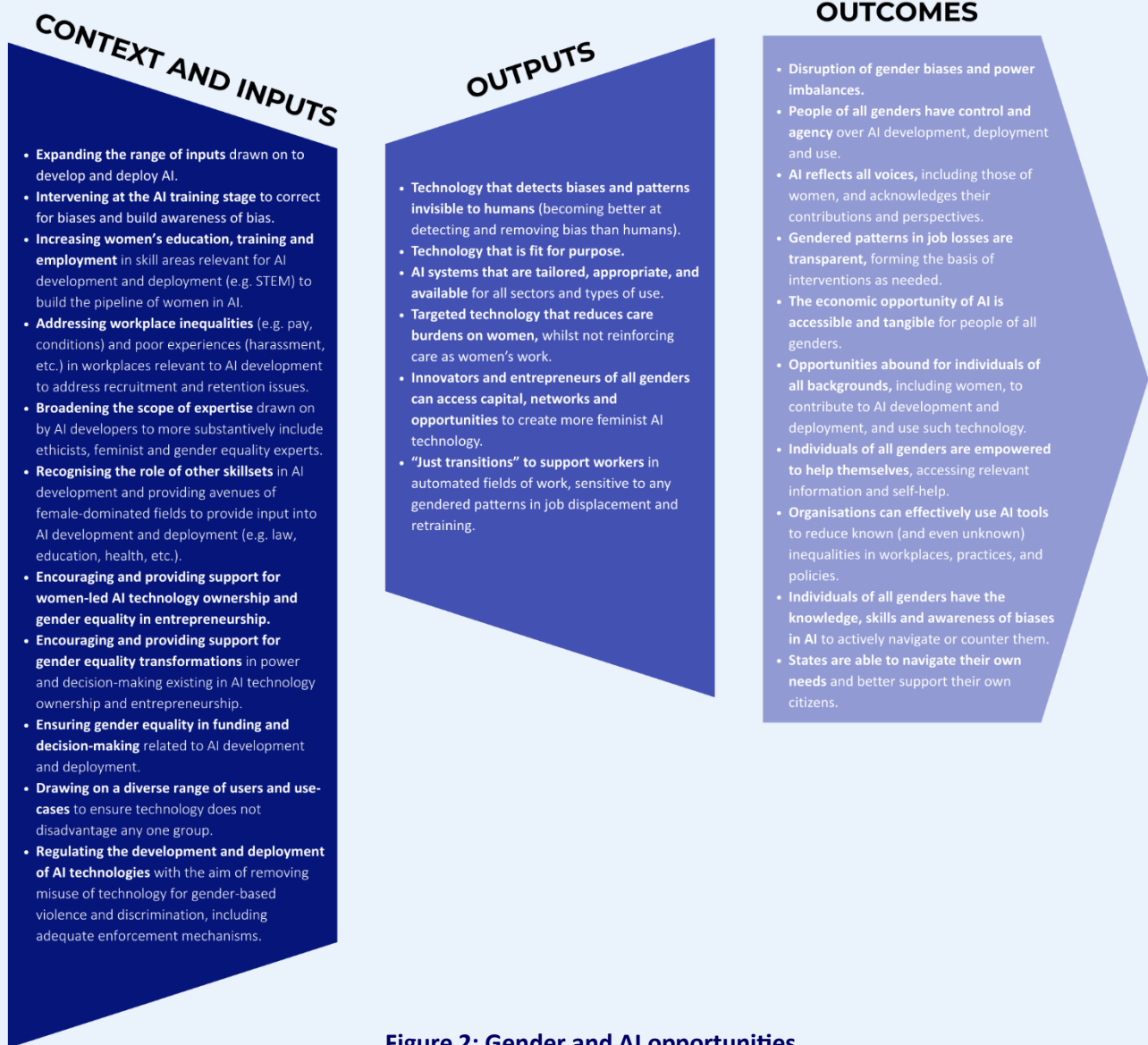
Figure 2: Gender and AI opportunities